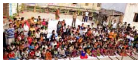
On the last day of the first term, the students of Class One surprised the entire JAAGO school with a drama and dance program that they organized themselves. The program ended with a massive dance with not only the students but the volunteers, teachers and employees as well. Thank to all the students of Class one for organized such a wonderful event for us.